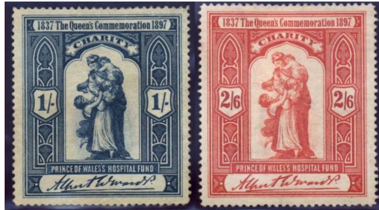
Prince of Wales's Hospital Fund for London, 1897

Cinderellas are stamps produced for reasons other than postal usage. In the realm of medical philately, the Russian "Zemstvo" medicine stamps, the Prince of Wales's Hospital Fund for London, New Zealand Patriotic labels and the South African SANTA "Christmas" stamps can "legitimately" be included in a thematic collection(illustr 3).