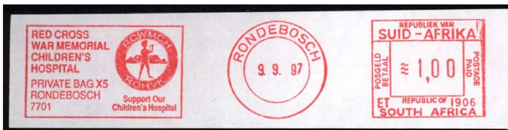
Machine franking bearing the cachet "Red Cross War Memorial Children's Hospital"

A cachet is an embossed, hand-stamped or machine-printed devise marked on postal stationery to convey information. These may be official, applied by the post-office during the cancellation process usually to promote national healthcare interests (as in "AIDS AWARENESS WEEK") or by private concerns to market a company, product or service. In countries such as the United States this practise is widely and profitably used and provides a fertile field of exploration to the thematic hobbyist (illustr 4).