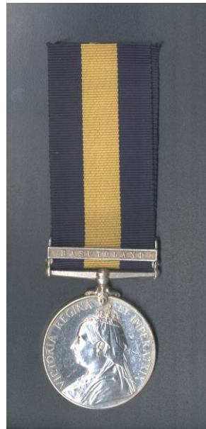
Cape of Good Hope General Service Medal, bar: Basutoland

He was in the Cape Mounted Rifles and was awarded the Cape of Good Hope General Service Medal (1880-1897), bar: Basutoland, presumably for activities relating to the Basutoland Gun War (1880-1881). On the roll, he is listed as a Surgeon Major, one of two in the regiment.